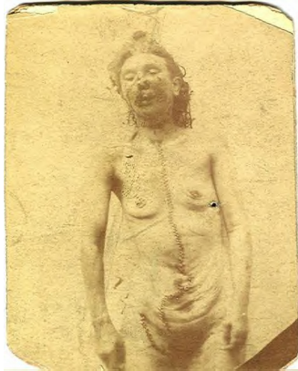
Another Ripper victim: the post-mortem photographs of Catherine Eddowes.